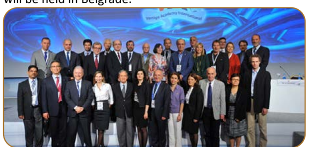
I. Vertigo Academy International 16-17 November 2013 Antalya, Turkey

Following four successive previous meetings in Turkey, Russia, India and Belarus, the V. Vertigo Academy International Meeting will be held in Belgrade.