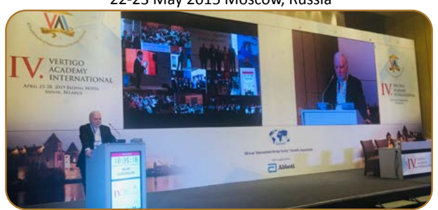
IV. Vertigo Academy International 25-28 April 2019 Minsk, Belarus