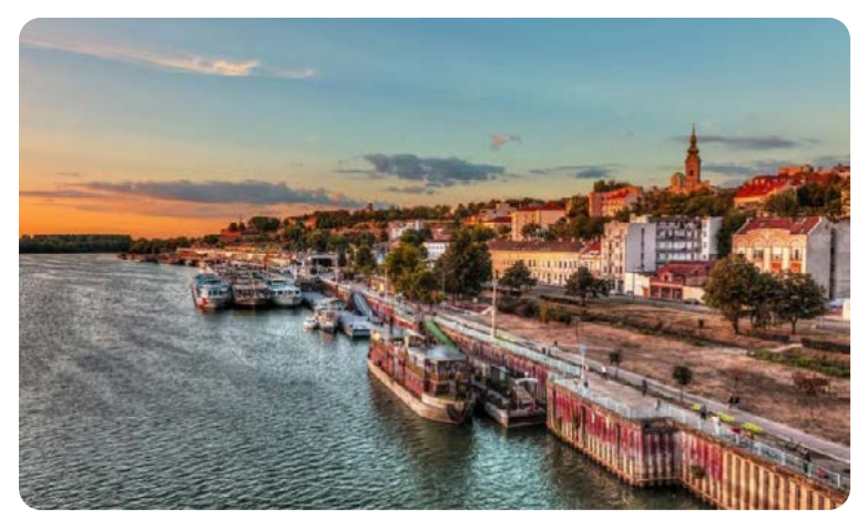
Danube River, Belgrade, Serbia

Belgrade is located at the convergence of three historically important routes of travel between Europe and the Balkans: an east-west route along the Danube River valley from Vienna to the Black Sea; another that runs westward along the valley of the Sava River toward Trieste and northern Italy; and a third running southeast along the valleys of the Morava and Vardar rivers to the Aegean Sea. To the north and west of Belgrade lies the Pannonian Basin, which includes the great grain-growing region of Vojvodina.