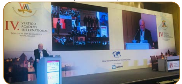
IV. Vertigo Academy International 25-28 April 2019 Minsk, Belarus