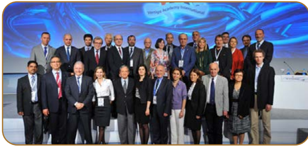
I. Vertigo Academy International 16-17 November 2013 Antalya, Turkey

Following four successive previous meetings in Turkey, Russia, India and Belarus, the V. Vertigo Academy International Meeting will be held in Belgrade.