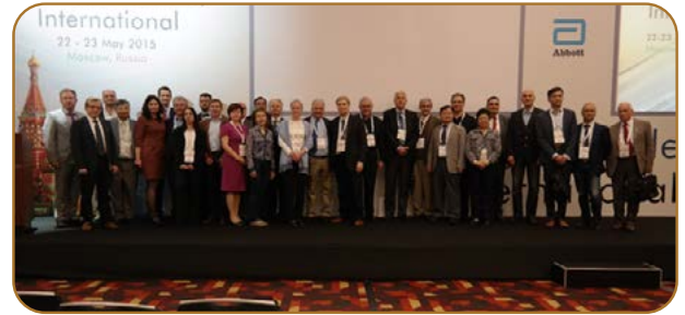
II. Vertigo Academy International 22-23 May 2015 Moscow, Russia