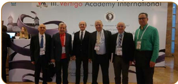
III. Vertigo Academy International 02-04 March 2017 Mumbai, India