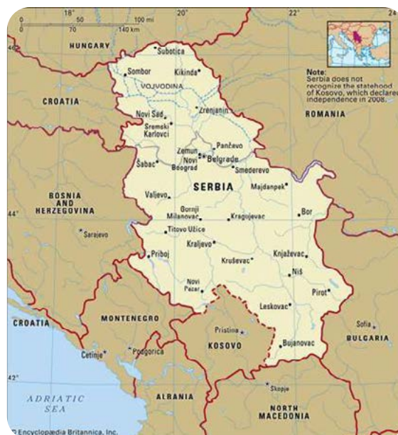
Serbia Map, Encyclopædia Britannica, Inc.