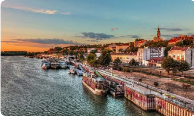
Danube River, Belgrade, Serbia

Belgrade is located at the convergence of three historically important routes of travel between Europe and the Balkans: an east-west route along the Danube River valley from Vienna to the Black Sea; another that runs westward along the valley of the Sava River toward Trieste and northern Italy; and a third running southeast along the valleys of the Morava and Vardar rivers to the Aegean Sea. To the north and west of Belgrade lies the Pannonian Basin, which includes the great grain-growing region of Vojvodina.